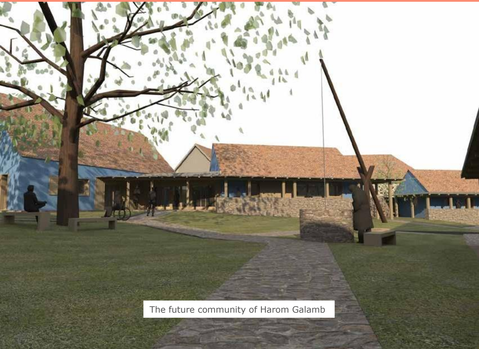
The future community of Harom Galamb

While “stroking into the landscape” the building complex intended to be the home of Harom Galamb (Three Doves), a beautiful site hidden in the elbow bend of the Upper Street in Porumbenii Mici, we had the opportunity to reflect deeply as architects on the lives and worlds hidden in the shells of the soul. Is it a fully protected environment, radiating security and predictability, or a place that prepares you for life outside, setting up a ladder of challenges to be climbed? A temporary existence or a forever home, a world in the world? And finally, we understood that it is all of these things in one. We have been brought closer to knowledge with each conversation with Zsuzsa and all those who believe with her that there is always a way to a fulfilled life, if we persevere in the search.